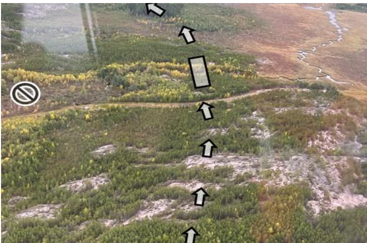
Photo: The original proposed bridge location identified with “⊘” on the image, was moved east to the area identified with the arrows, to avoid the wetland and to provide a better approach to the crossing.

One example of how we adjusted the design is shown below. A more detailed poster is available, and we look forward to road specific discussions with you in your community over the winter months.