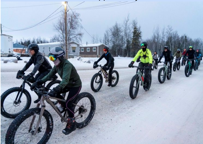
110km “fat bike” ride from Red Lake to Pikangikum raises $55,000.

Some recent events supported by Frontier Lithium are pictured below.