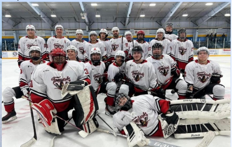
Sandy Lake Tomahawks compete in Northern Band Hockey Tournament sporting new jerseys!