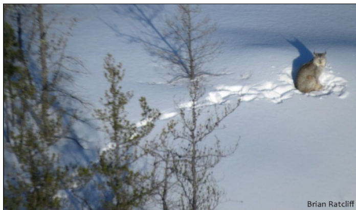
A lynx spotted during an aerial wildlife survey carried out this winter.