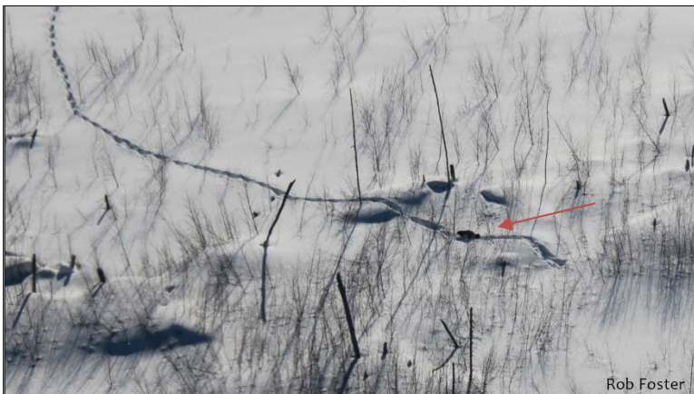
Wolverine #1 and #2 observed on March 8, 2024.

The results of the survey will support project permitting.